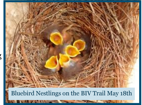
Bluebird Nestlings on the BIV Trail May 18th

cially be certain to note our advice on dealing with young backyard birds which you feel are in peril or may be at risk. We always applaud any inclination to help our backyard feathered friends, however it is important to remember that every intervention is not helpful ...and may even be harmful. It is ALSO important to be very cautious when consulting the internet when look-