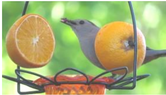
Above: Gray Catbird at jelly feeder Right: Yellow-rumped Warbler