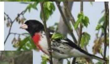
Above & Left: Rose-breasted Grosbeak in the BIV Bird Garden