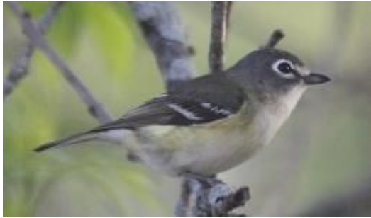
Above: Blue-headed Vireo