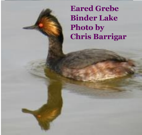
Eared Grebe Binder Lake