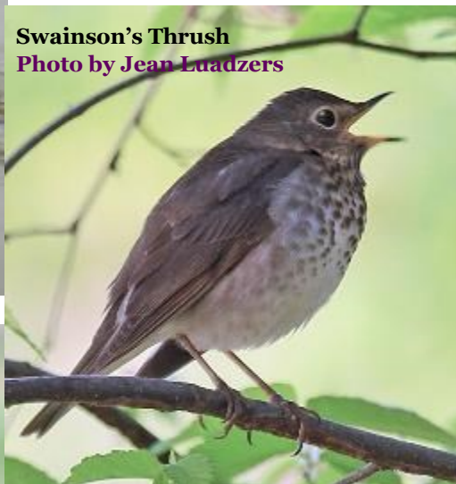
Swainson's Thrush