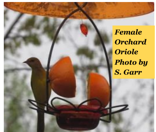
Female Orchard Oriole

Drop by Birds-I-View to see the Complete Bird update List and to record YOUR bird sightings!