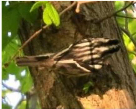
Above: Black and White Warbler Top Right: Common Yellow-throat Both birds in the BIV Bird Garden