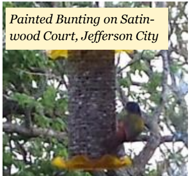
Painted Bunting on Satinwood Court, Jefferson City