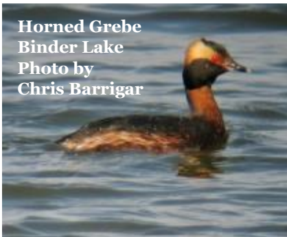
Horned Grebe Binder Lake