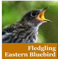
Fledgling Eastern Bluebird