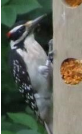
Above: Adult male Hairy Woodpecker at Suet Log— note the bright red patch on the back of the head area.

Take a closer look this month at the woodpeckers coming to feeders (with adults AND on their own) at bird baths, hopping around after adults and begging for food at feeders and in trees and shrubs. Seems juvenile and immature woodpeckers are everywhere right now! We mention it often but it bears repeating: Be sure to consult a variety of field guides to brush up on identifying some of your favorite backyard birds in their immature plumage. For starters, check out the “Birds: Their First Year” Brochure on the Educational Page of our website. Then take advantage of our “Always 10% OFF” pricing on all books at BIV to freshen your collection of Bird Field Guides. Below is an example of why it is so helpful to have access to more than one reference