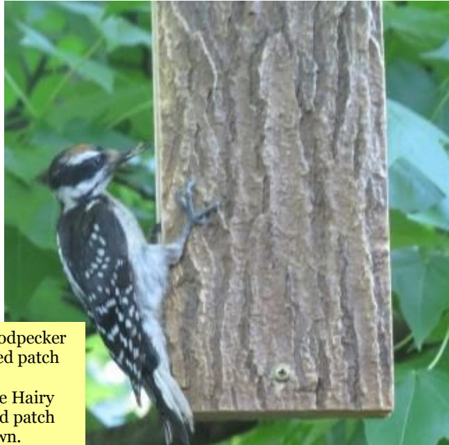
Above Right: Immature male Hairy Woodpecker—note the pale red patch near the Top/Front of the crown.

book (or website or app). Both of the images below are Hairy Woodpeckers . The one on the far left is an adult male Hairy (in the BIV Bird Garden—note the leg band). See the bright red patch on the back of his head? Well compare that to the bird in the pic next to it and note the faint red patch on the front crown area of his head. That mark helps to distinguish it as an immature bird, yet several of the field guides we consulted made NO mention of this field mark, and only a handful showed a picture or drawing.