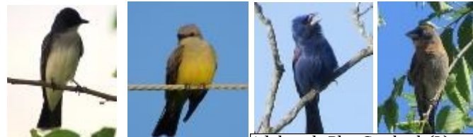
Eastern Kingbird (L) Western Kingbird (R)

(thanks Jane!). A Blue-Gray Gnatcatcher and Orchard Orioles have also been reported at Binder. Steve and I were very thrilled to have THREE very vocal Great crested Flycatchers in the BIV Garden recently!