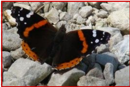
Above: Red Admiral