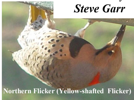
Northern Flicker (Yellow-shafted Flicker)