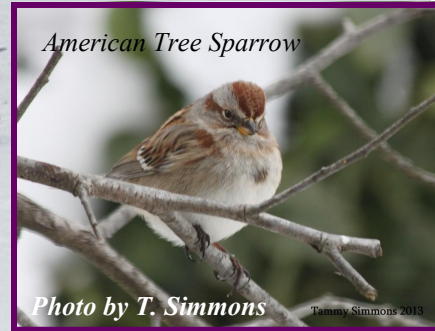
American Tree Sparrow

Above: An American Goldfinch picks new growth from a branch on one of the trees in the BIV Bird Garden! This is fairly typical of Goldfinches– watch YOUR Goldfinches closely to see this behavior.