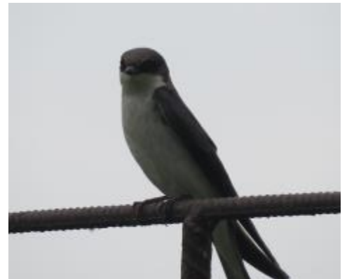
Above: One of the Tree Swallows nesting on the property