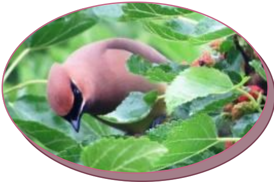
Above: a Cedar Waxwing can't resist the fruit in this Mulberry tree