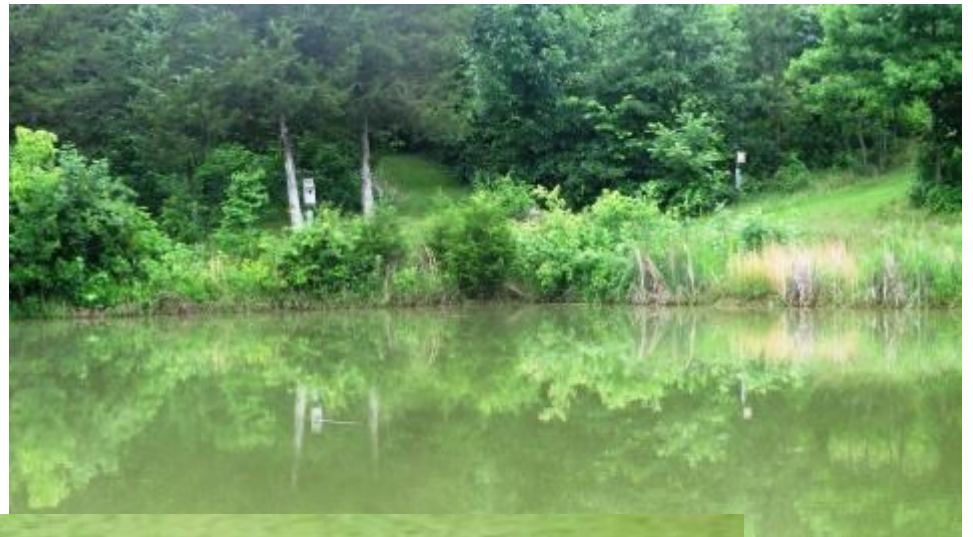
Wood Duck hen with seven ducklings in tow!