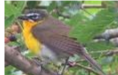
Yellow-breasted Chat at Mockingbird Hill 6/9/14