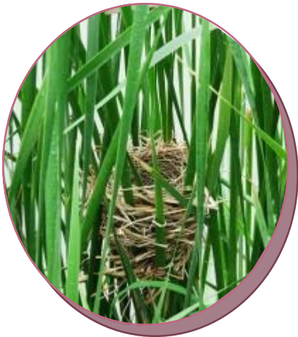
Below: a Red-winged Blackbird nest woven among the cattails