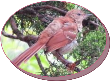
Above: an immature Brown Thrasher

(approx. 1.5 hour bird walk.....35 species)